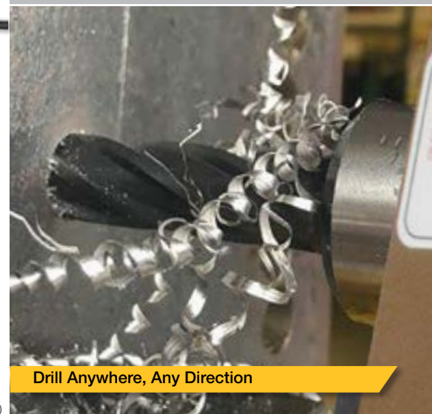
Drill Anywhere, Any Direction