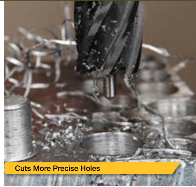
Cuts More Precise Holes