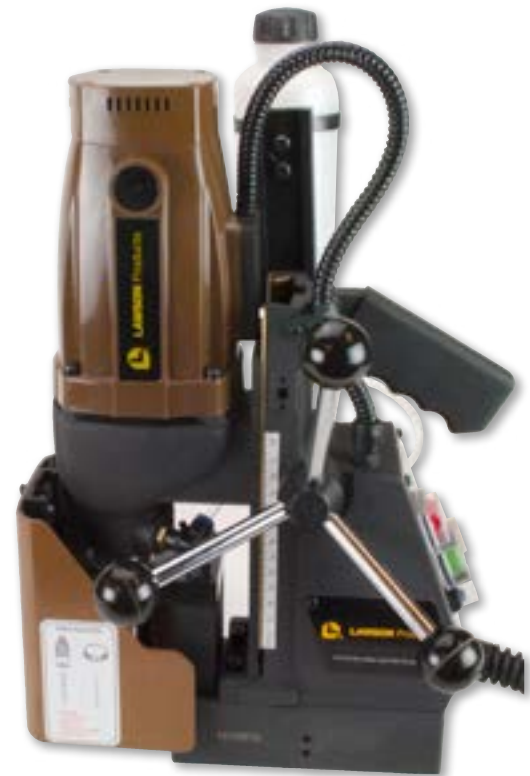
Item No. 1574562

Lawson's portable magnetic drill allows you to take the drill to your work piece. It can be used in vertical, horizontal or overhead positions.