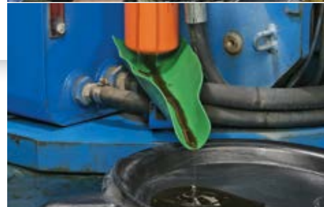
No Mess Fluid Changes