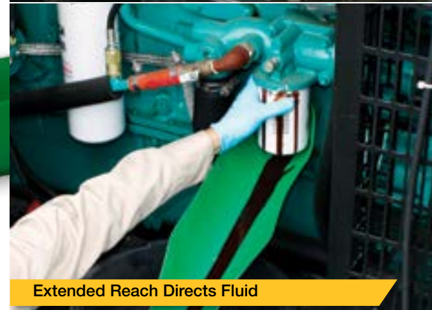
Extended Reach Directs Fluid