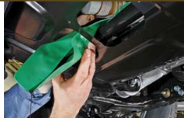
Works Securely In Tight Spaces