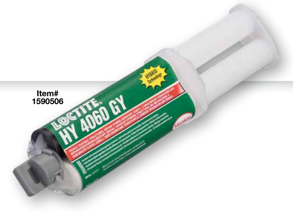
No Tips Required

Loctite® HY 4060™ GY is an ideal replacement for traditional two-part, 5-minute epoxies. This product is ready-to-use and can be dispensed directly from the pack without additional equipment