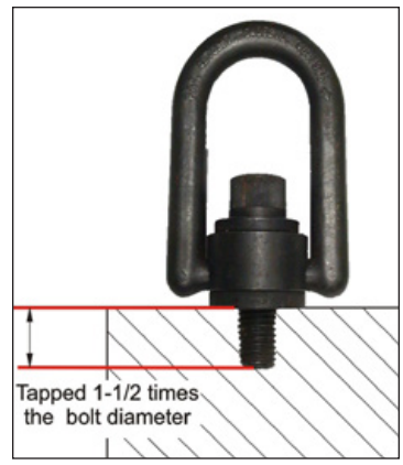
Swivel hoist ring in threaded hole