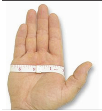
Fig. 1 – Measure the circumference of hand across the palm

Properly fitting gloves are important. Gloves that are too small are binding and cause hand fatigue. Gloves that are too large are uncomfortable and can be hazardous. To determine glove size, measure the circumference of the hand across the palm (Fig. 1), then refer to the chart below. This chart is meant to be used as a guide only.