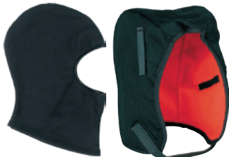
Stretch Fleece Balaclava