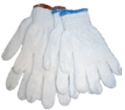
String Knit Gloves