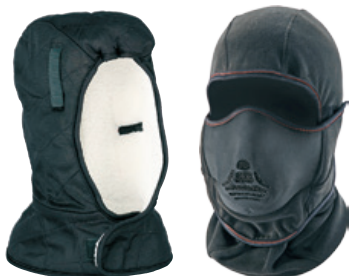
Shoulder Length Triple-Layer Winter Liner

Cold Series Stretch Cap-Style Balaclavas are designed to fit over hats. They come in half-face and full-face styles. The cap keeps head and ears protected from the wind and cold.