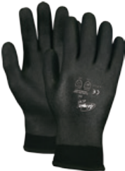
Thermal Waterproof Gloves with Gauntlet Cuff

String Knit Gloves can also be used as liners for an extra layer of protection in colder weather. Liners come in three different weights.