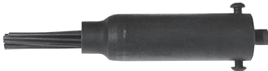
Needle Scaler Adapter Kit – Carbon Steel Part No. CW1672