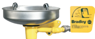
Plumbed Eye Wash Stations