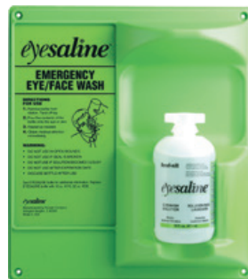
Fig. 4. Example of a personal eye wash station (Item No. SF10120)