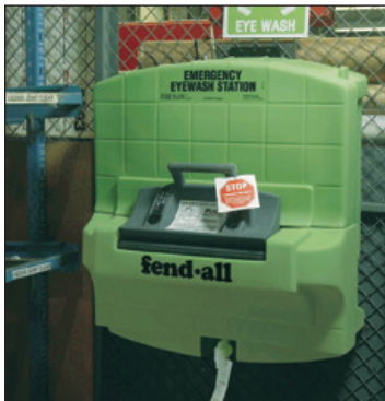
Fig. 2. Example of a portable eye wash unit (Item No. SF10706)