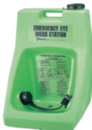
Porta Stream® I