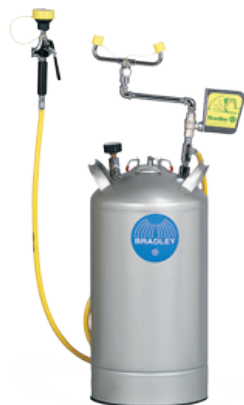
Pressurized Eye Wash Stations

These eye wash stations must be checked on a weekly schedule to ensure the unit is in proper operating condition. Records of these weekly inspections should be kept with the unit.