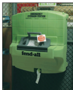
Pure Flow 1000®

Inspect these eye wash stations monthly to ensure proper operating conditions. Inspection records must be kept with the unit. If the "WARNING – SERVICE IMMEDIATELY" notice is visible or if the activating door is open, replace cartridges immediately.