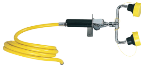
Fig. 5. Example of a drench hose (Item No. SF14273)

Lawson Products, Inc. offers options from three popular categories of emergency fixtures and additional supplemental equipment. These include: