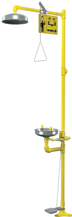
Fig. 3. Example of a combination unit (Item No. SF14259)