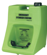
Porta Stream® II

Regular inspection is required to ensure these safety devices are ready at all times.