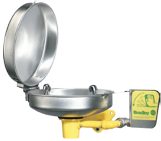
Fig. 1. Example of a plumbed eye wash unit (Item No. SF14252)