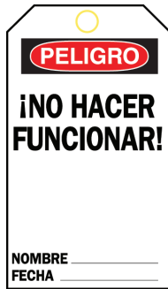
Reverse Side G