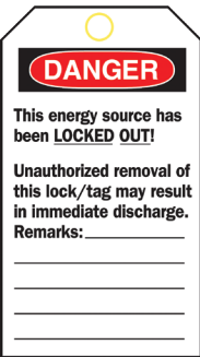
Reverse Side B