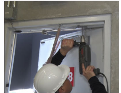
Hollow metal door frame into concrete