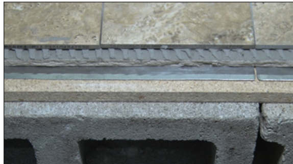
Example of stacked layers of different materials (from top to bottom: porcelain or ceramic tile, thinset, sheet metal, particle board, cinder block)