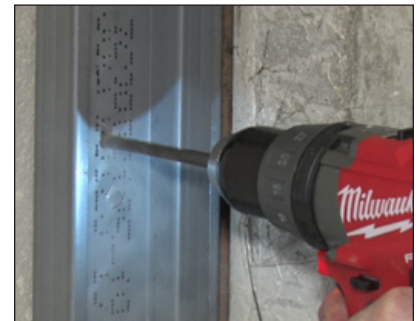
Drill through metal stud into concrete